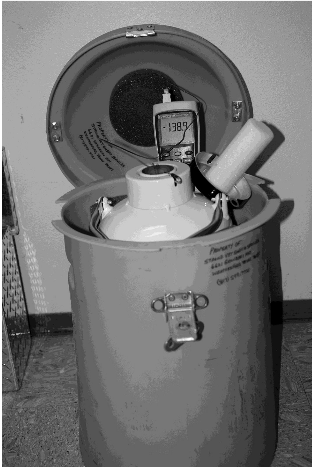
Figure 2. Dry shipper 10 days post charging with liquid nitrogen. Temp – 138.9° C

Plastic goblets snapped onto canes inside dry shippers will not have liquid nitrogen in them, so time in the neck of the shipper should be kept to a minimum when viewing or handling the contents. The eight second rule also applies to dry shippers. Canes of semen or embryos